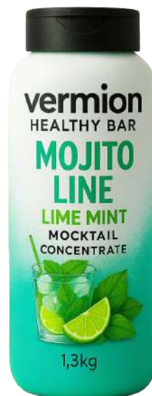
MOJITO LIME MINT